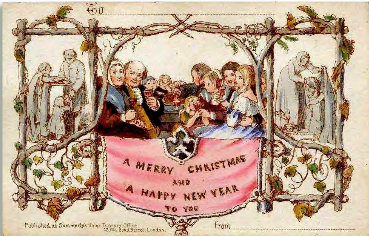
The first Christmas card printed and sold in London in 1843.